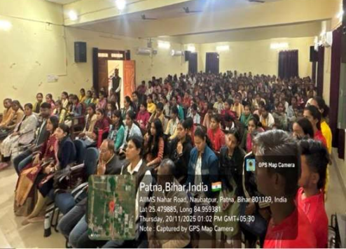
Patna, Bihar, India AIMS Nahar Road, Naubatpur, Patna, Bihar 801109, India Lat 25.479885, Long 84.959381 Thursday, 20/11/2025 01:02 PM GMT+05:30