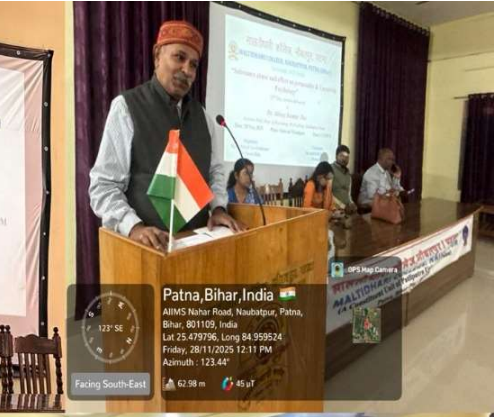
Patna, Bihar, India AIMS Nahar Road, Naubatpur, Patna, Bihar 801109, India Lat 25.479796, Long 84.959524 Friday, 28/11/2025 12:11 PM GMT+05:30 Azimuth: 123.44 Facing South-East