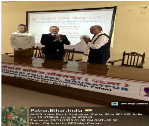
Patna, Bihar, India AIMS Nahar Road, Naubatpur, Patna, Bihar 801109, India Lat 25.4799849, Long 84.9593443 Thursday, 20/11/2025 01:00 PM GMT+05:30 Note : Captured by GPS Map Camera