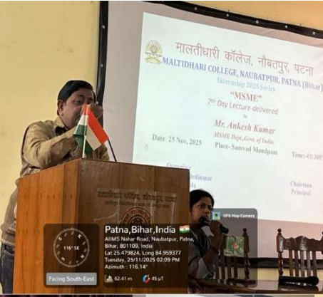
Patna, Bihar, India AIMS Nahar Road, Naubatpur, Patna, Bihar 801109, India Lat 25.479824, Long 84.959377 Tuesday, 25/11/2025 02:09 PM GMT+05:30 Azimuth: 116.14 Facing South-East