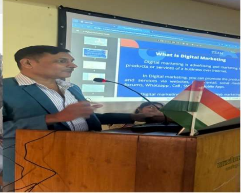
Patna, Bihar, India AIMS Nahar Road, Naubatpur, Patna, Bihar 801109, India Lat 25.479798, Long 84.959387 Saturday, 22/11/2025 01:55 PM GMT+05:30 Azimuth: 123.89 Facing South-West