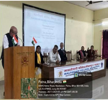
Patna, Bihar, India AIMS Nahar Road, Naubatpur, Patna, Bihar 801109, India Lat 25.479856, Long 84.959387 Thursday, 20/11/2025 01:27 PM GMT+05:30 Note : Captured by GPS Map Camera