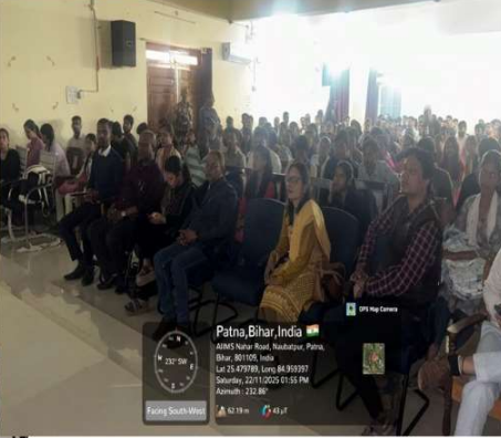
Patna, Bihar, India AIMS Nahar Road, Naubatpur, Patna, Bihar 801109, India Lat 25.479798, Long 84.959387 Saturday, 22/11/2025 01:55 PM GMT+05:30 Azimuth: 123.89 Facing South-West