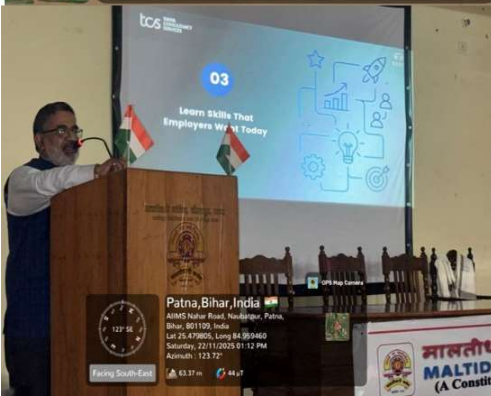
Patna, Bihar, India AIMS Nahar Road, Naubatpur, Patna, Bihar 801109, India Lat 25.4799849, Long 84.9593443 Saturday, 22/11/2025 01:12 PM GMT+05:30 Azimuth: 123.192 Facing South-East