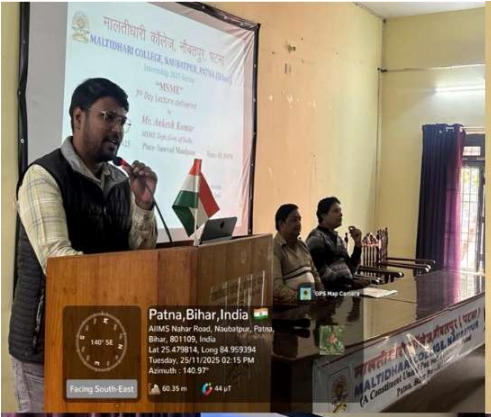
Patna, Bihar, India AIMS Nahar Road, Naubatpur, Patna, Bihar 801109, India Lat 25.479814, Long 84.959394 Tuesday, 25/11/2025 02:15 PM GMT+05:30 Azimuth: 146.97 Facing South-East